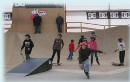
SkiSkate Amadora park

Individual Attendance Office (support and empowerment for learning and job creation); Youth Night (Empowerment for youth interests and studies).