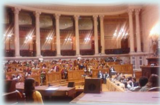
Assembly of the Republic Senate room

On the 21 st November this Forum organized, as well, the commemorative ceremony of the 22 nd anniversary of the Children's Rights Convention with a massive the participation of children and youth. This event took place on the beautiful Assembly of the Republic Senate room. The OMEP Pt was represented by its president of the general assembly, and by the board president and treasurer.